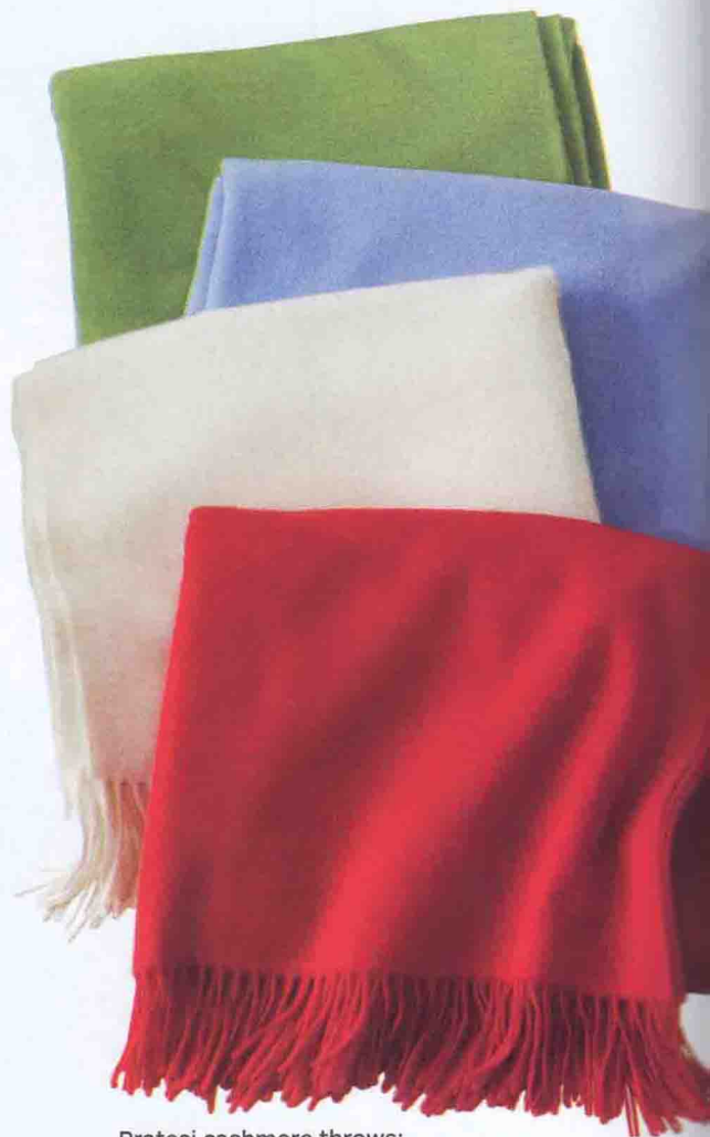
Pratesi cashmere throws; 212-288-2315