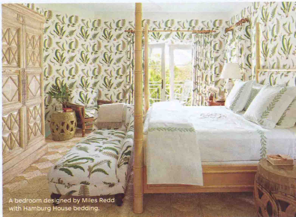
A bedroom designed by Miles Redd with Hamburg House bedding.

“Sometimes getting the right bed linens comes down to serendipity. I couldn’t believe it when I found these ready-made Hamburg House sheets embroidered with a fern pattern that perfectly matched the botanical-print fabric I was using.”